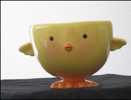
DESSERT BOWL SFO-016 MINIMUM BID: $8.00