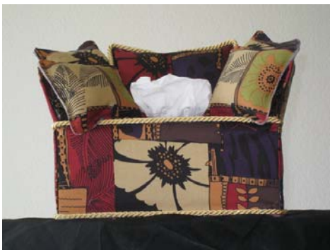
Tissue box cover. SFO0- 012. Minimum bid: $13.00