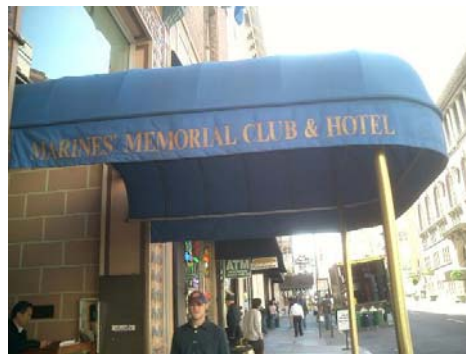
2 Night stay at the Marine Memorial Club & Hotel, San Francisco Plus a $50.00 Dinner. SFO-011 Minimum bid: $225