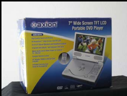
AXION DVD PLAYER SFO-018 MINIMUM BID: $30.00