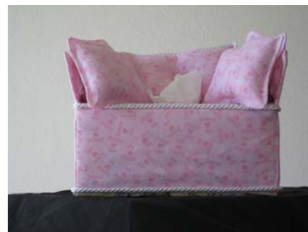
Tissue Box cover (pink) SFO-013 Minimum bid $13.00