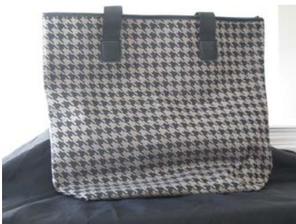
Black and white tote. SFO-022 Minimum bid: $15.00