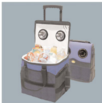
Rolling Musicooler SFO-019 Minimum Bid: $40.00