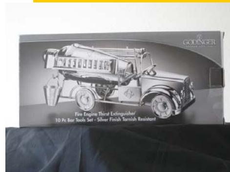
Thirst Extinguisher-10 pc Bar tools set. Minimum bid: $15