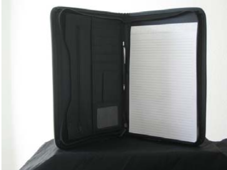
Faux Leather Portfolio SFO-007 Minimum bid: $8.00