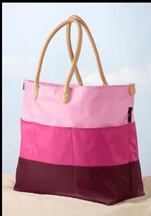
SUMMER TOTE MINIMUM BID : $15.00 SFO-020