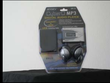
Jensen Cyber MP3 Audio Player SFO-006 Minimum