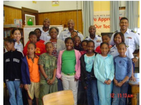
Upper left and above display Bayou Chapter members with students and teachers at Morris F.X. Jeff Elementary

4 th -grade students must score at least Basic in one of two subjects: English or Math. Understanding the need for improvement in these areas, the Bayou chapter members came together to reinforce 4 th grade language and mathematical skills to the students. 3 rd grade students were also targeted for advanced preparation in expecting what's to come in the next school year.